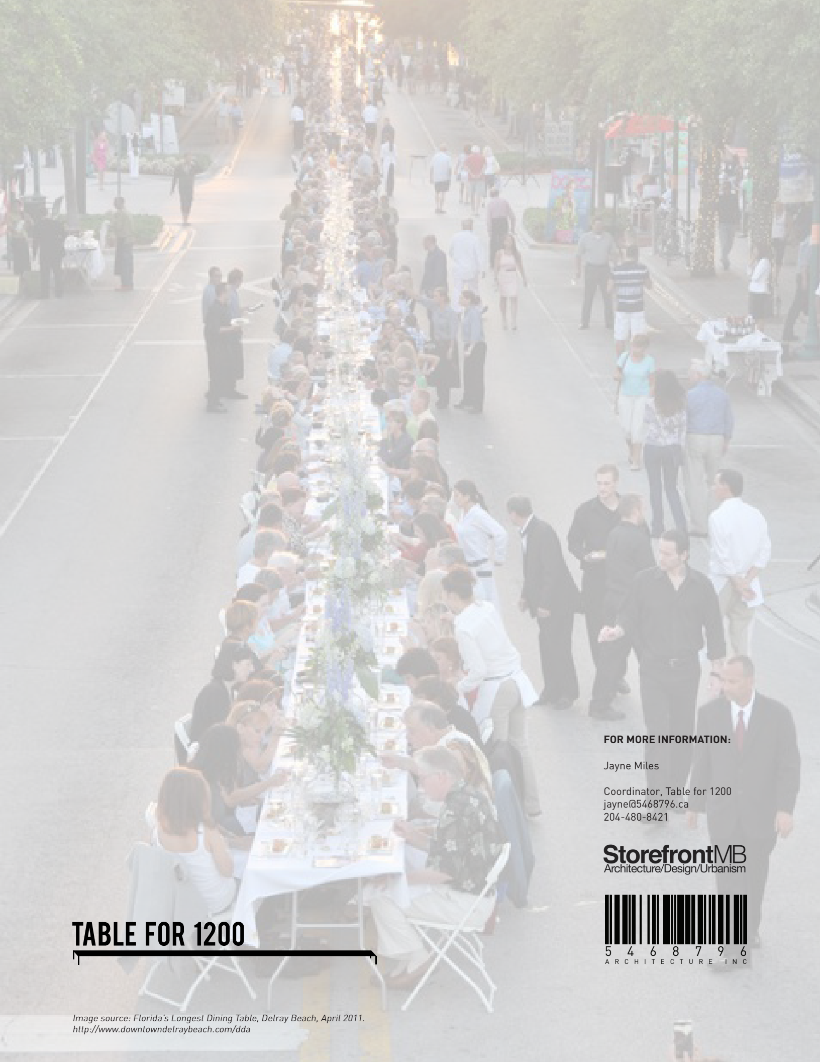
TABLE FOR 1200